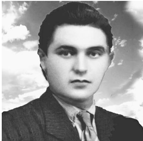
Figure 1. Luther Blissett’s portrait. Creative Commons Attribution— ShareAlike 2.5

The subjective disaggregation and dispersal of the author also has a temporal dimension. The name was borrowed from the Jamaica-born British footballer, Luther Blissett, who played an ill-fated season at AC Milan in 1983, contrary to great expectation. But no explanation is provided as to the reasons for the adoption of the footballer’s name. Indeed, after a fabricated identification of the Luther Blissett multiple name with the conceptual art practice of one “Harry Kipper” (a tactic intended to divert from the start any association of the multiple name with its creators), the proliferation of origin stories became a part of the multiple name itself: “Anyone who makes use of the name may invent a different story about the origin of the project” (Blissett