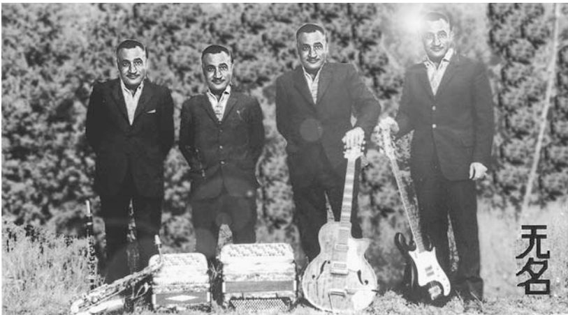
Figure 3. Wu Ming’s portrait (2009–). Creative Commons Attribution—ShareAlike 3.0

In contrast to the concentrative and authoritarian function of the cult of personality—premised, at least in Mao’s case, on the singular “truth” of the integrating leader—here myth is a collective endeavor without a determined subject, not a “people” but a processual “monster,” stitched together and patched up through its situated and variable iterations. Wu Ming’s not infrequent encounters with orthodox Left icons should be approached with this understanding—it is as if even these highly integrated images can be rerouted and potentialized through the disaggregating powers of the unidentified narrative object. Something of this is apparent in Wu Ming’s new self-portrait (Figure 3). “صانلا دبع لامج” (Gamal Abdel Nasser) provides a key component of the image, but it is a strange montage, where Nasser’s face is multiplied four-fold and placed on the heads of a filuzzi dance band. As fragments of pan-Arabist icon, Mediterranean basin, Italian working